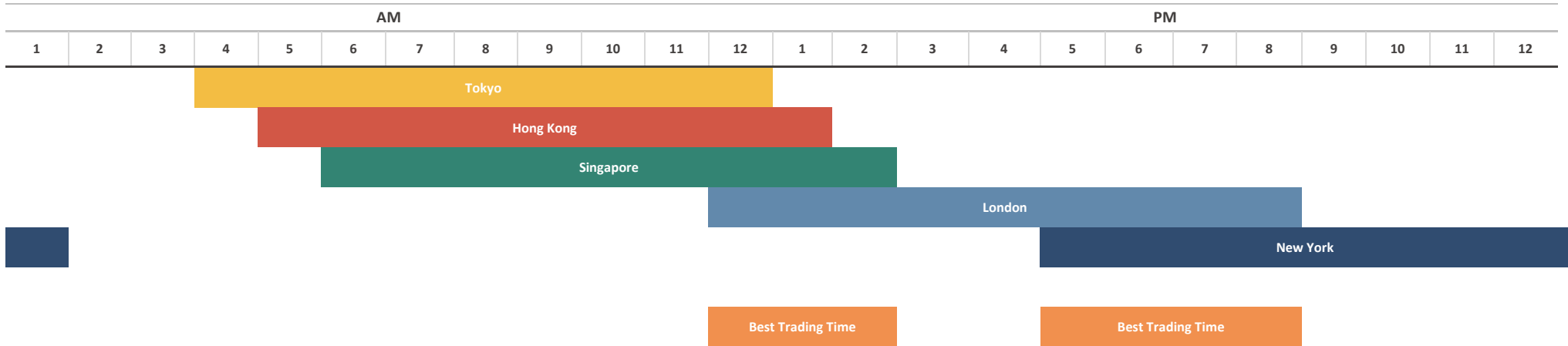
Forex Market Hours

Note: This chart shows the normal forex trading times of all the major forex trading centers across the globe in Pakistan Standard Time.